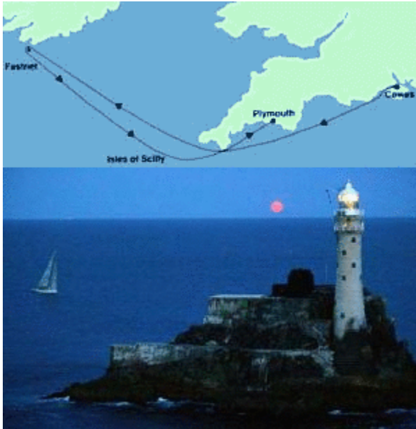
The Rolex Fastnet Race Course

The challenging 750 mile course takes you out of the Solent, past the Needles, and along the South Coast of England, past the many headlands where tricky tidal gates and large wind shadows from the land make for interesting sailing.